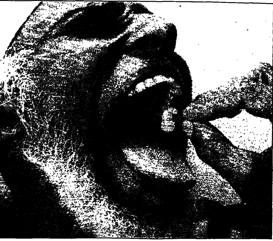
An asthma sufferer opens wide to swallow a live fish and herbs, believed to cure the ailment. More than 300,000 patients converged on Hyderabad on Sunday to consume the "miracle" cure.